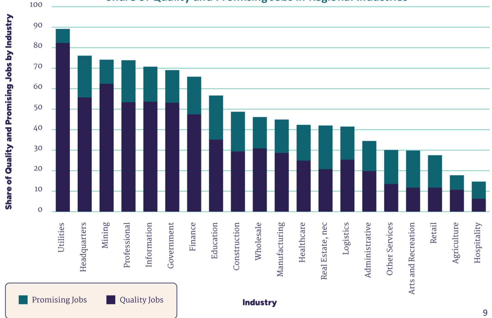
Share of Quality and Promising Jobs in Regional Industries

This means that both job creation and workforce preparedness efforts need to be carefully targeted.